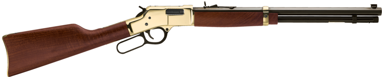
Henry Big Boy Rifle Cal. .44 Magnum

Bring your prospective new member to a general membership meeting and when the new member completes the membership application and pays their dues, you are handed a ticket, no charge! The drawing will be in January 2024, either at the RK Shows or the WMSA General Membership Meeting.