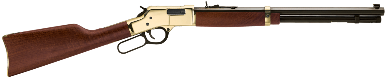
Henry Big Boy Rifle Cal. .44 Magnum

Bring your prospective new member to a general membership meeting and when the new member completes the membership application and pays their dues, you are handed a ticket, no charge! The drawing will be held when all tickets are sold (Possibly at MOVA-CA Show in July)