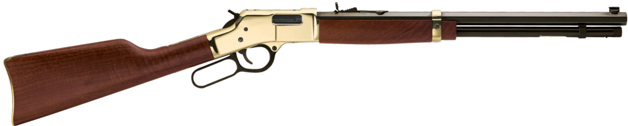
Henry Golden Boy Rifle Cal. .44 Magnum

Bring your prospective new member to a general membership meeting and when the new member completes the membership application and pays their dues, you are handed a ticket, no charge! The drawing will be in January 2024, either at the RK Shows or the WMSA General Membership Meeting.