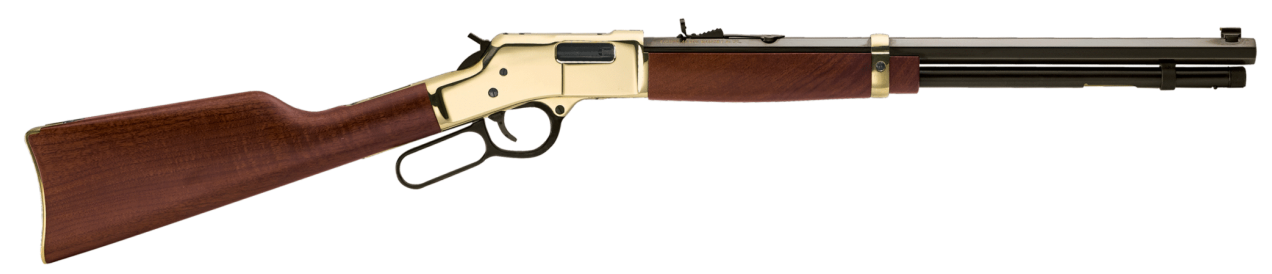
Henry Big Boy Rifle Cal. .44 Magnum

Bring your prospective new member to a general membership meeting and when the new member completes the membership application and pays their dues, you are handed a ticket, no charge! The drawing will be in January 2024, either at the RK Shows or the WMSA General Membership Meeting.