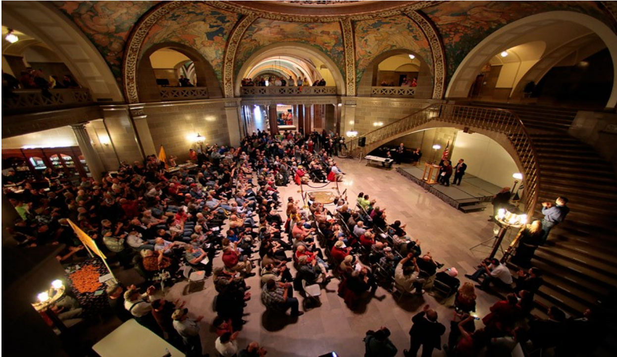
Rally Day, April 18, 2013.

Sponsored by: MPS (Missourians for Personal Safety), GCLA (Gateway Civil Liberties Alliance), WMSA (Western Missouri Shooters Alliance), MSSA (Missouri Sport Shooting Association), MissouriCarry.com , and other pro-freedom groups.